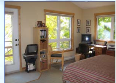
Master Bedroom w/ Private Deck