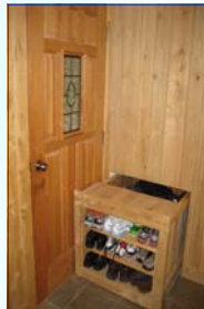
Designed w/ Space Saving' in mind!