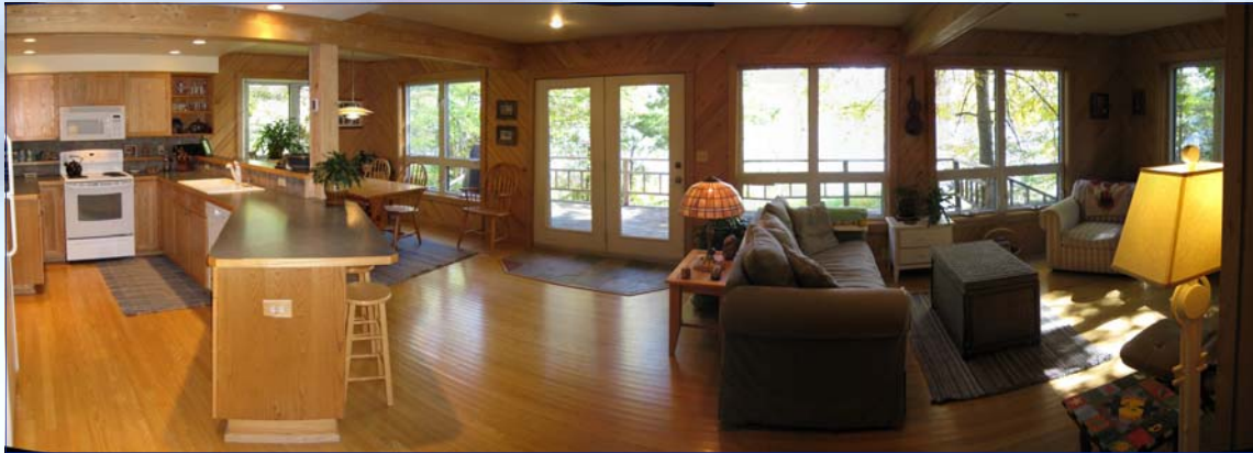
Main level features an stunning open floor plan, hardwood floors, tiled front entry and ML 1/2 Bath