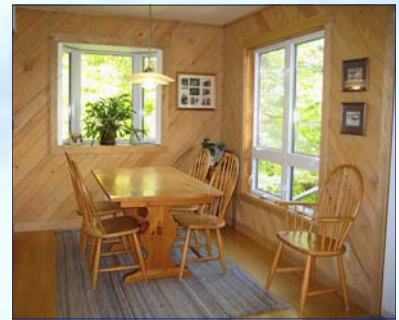
Dining Area w/ Bay Window