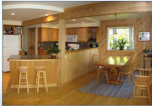
Custom Designed Black Ash Cabinetry